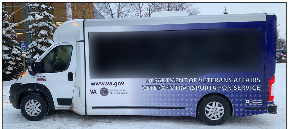
Figure 2: Example of Department of Veterans Affairs Veterans Transportation Service Van in Alaska

GAO-24-107559