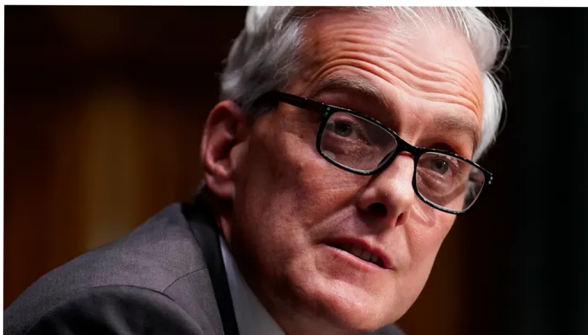
Secretary of Veterans Affairs nominee Denis McDonough speaks during his confirmation hearing before the Senate Committee on Veterans' Affairs on Capitol Hill, Wednesday, Jan. 27, 2021, in Washington.

Biden's VA undermining law that gives veterans access to private health care