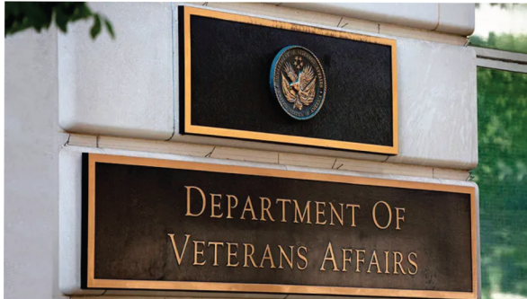
The US Department of Veterans Affairs building is seen in Washington, D.C. The agency said Friday it will offer abortions for veterans in certain cases.

VA declined to answer specific questions from Fox News Digital about when or why the link was changed to steer veterans toward VA care, and insisted VA remains committed to implementing the law.