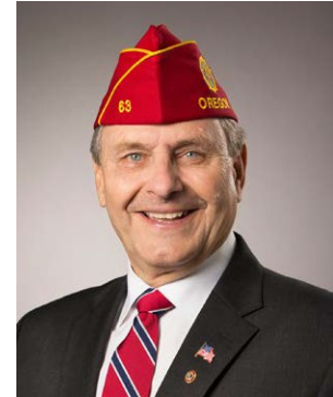
Charles E. Schmidt American Legion National Commander

That protection depends on proper funding. The American Legion and our nation's veterans have fought hard to make VA the best it can be. To restrict access to that care, or to shop it out to a less-qualified provider because solvable problems have emerged, is tantamount to telling veterans they simply don't deserve high-quality care if something cheaper can be found. That's not the message we should be sending.