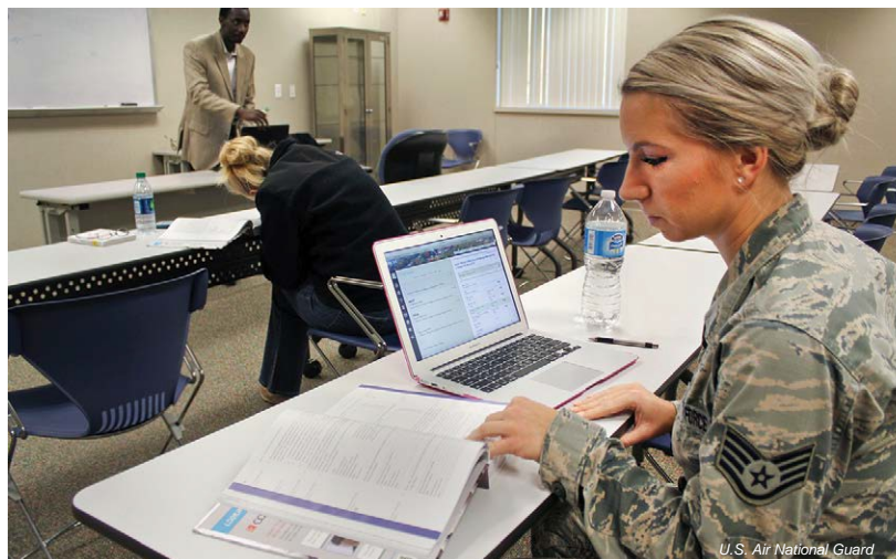
U.S. Air National Guard

» More than 25,000 National Guard and Reserve servicemembers have been activated under orders that don't count toward GI Bill benefits. Thousands more are expected to be placed on similar orders through 2020.