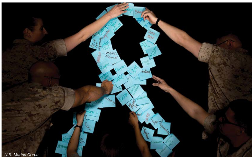
U.S. Marine Corps